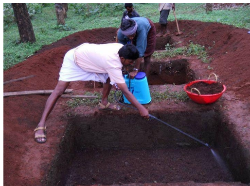
Figure 4: Spraying Novcom solution (25 ml in 5 ltr. water) over each layer of coir pith