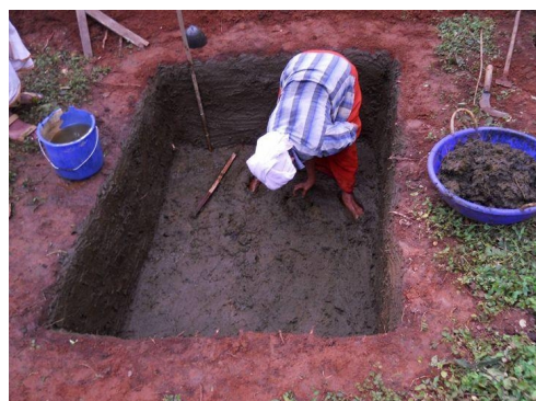
Figure 2: Pasting cow dung slurry at the base and four sides of the pit