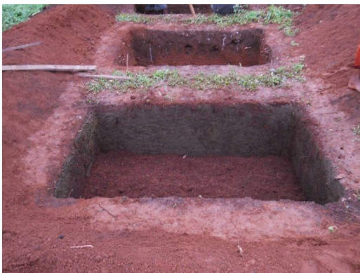
Figure 3: Stacking of coir-pith layer (0.5 ft.) within the pit (size: 6 x 4 x 2 ft.)