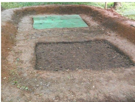
Figure 5: Completed pit on 1 st day