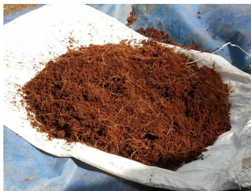
Figure 6: Raw coir pith before initiation of Novcom composting process