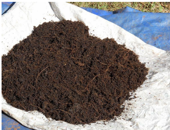
Figure 7: Mature Novcom coir pith compost after 21 days of composting