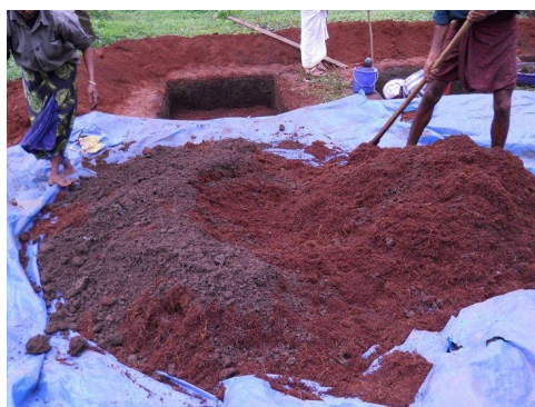
Figure 1: Mixing of coir pith and fresh cow dung (80: 20 ratio) on 1 st day